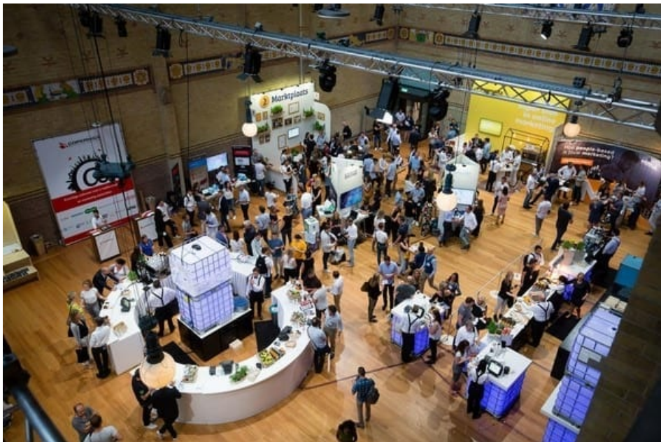
The Graanbeurszaal – location of the exhibition