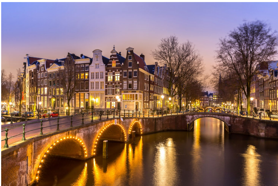
Enjoy the world-famous canals of Amsterdam!