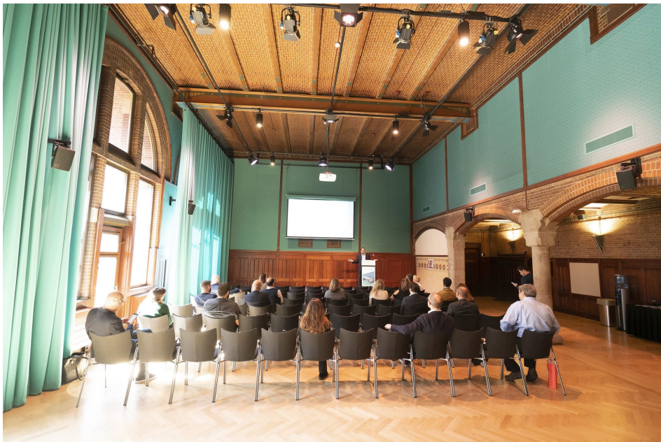
The Administratiezaal – location of Technical Sessions (the Veilingzaal is nearly similar)