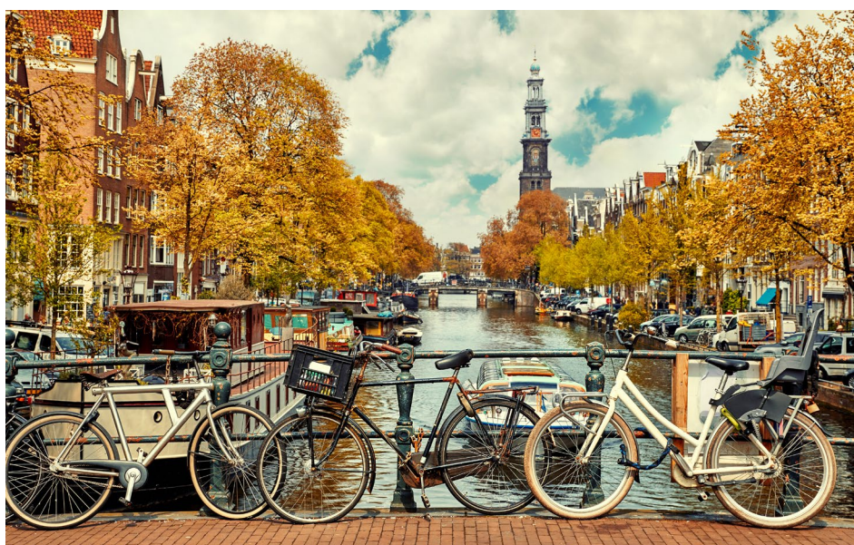
Amsterdam, one of the world's best touristic destinations!