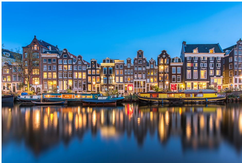
Amsterdam, city of art, science and innovation!