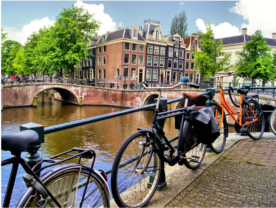
Rent a bike in beautiful Amsterdam!

Enjoy the pictures and impressions of this beautiful city and perfect conference location. Watch the Amsterdam city movie: https://youtu.be/yclFcmUd64U