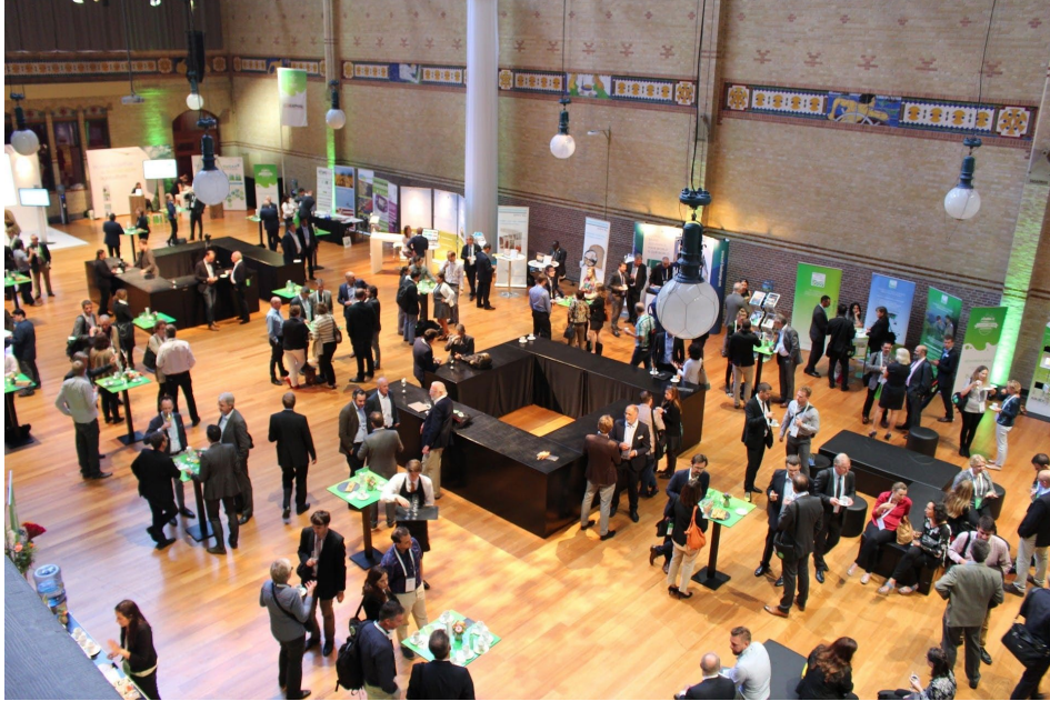
The Graanbeurszaal – location of the exhibition