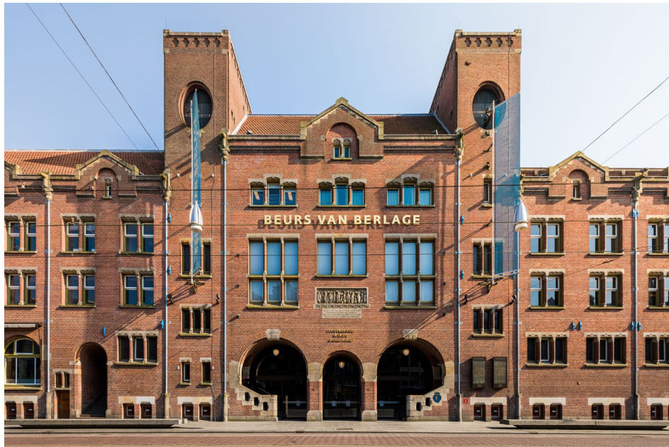
The Beurs van Berlage, in the heart of Amsterdam