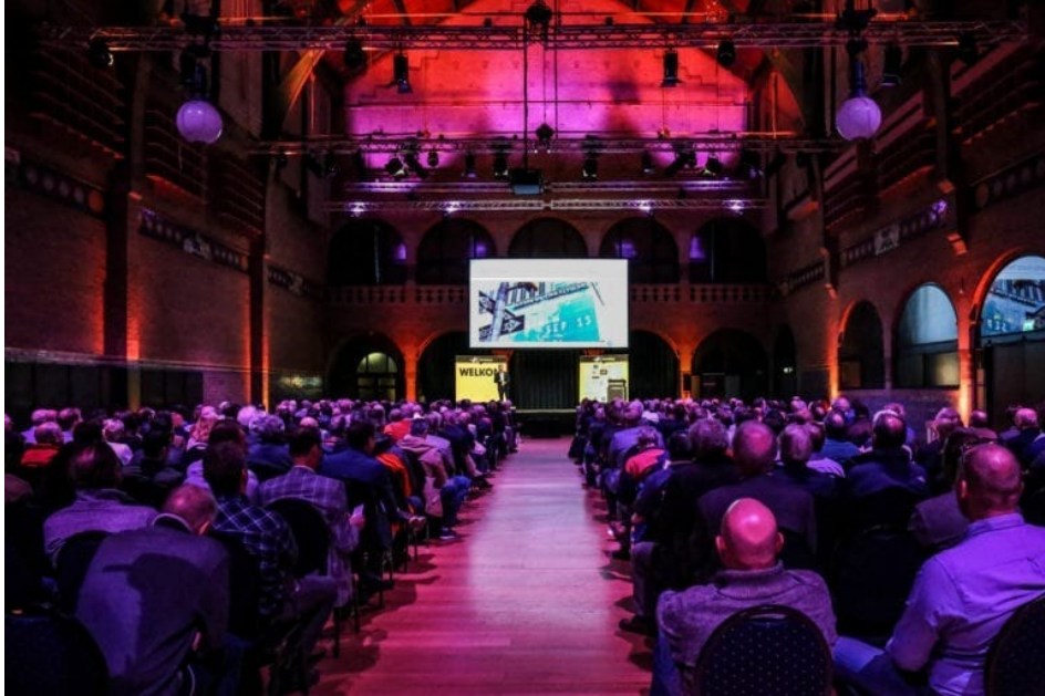
The Effectenbeurszaal – location of the Plenary and Technical sessions