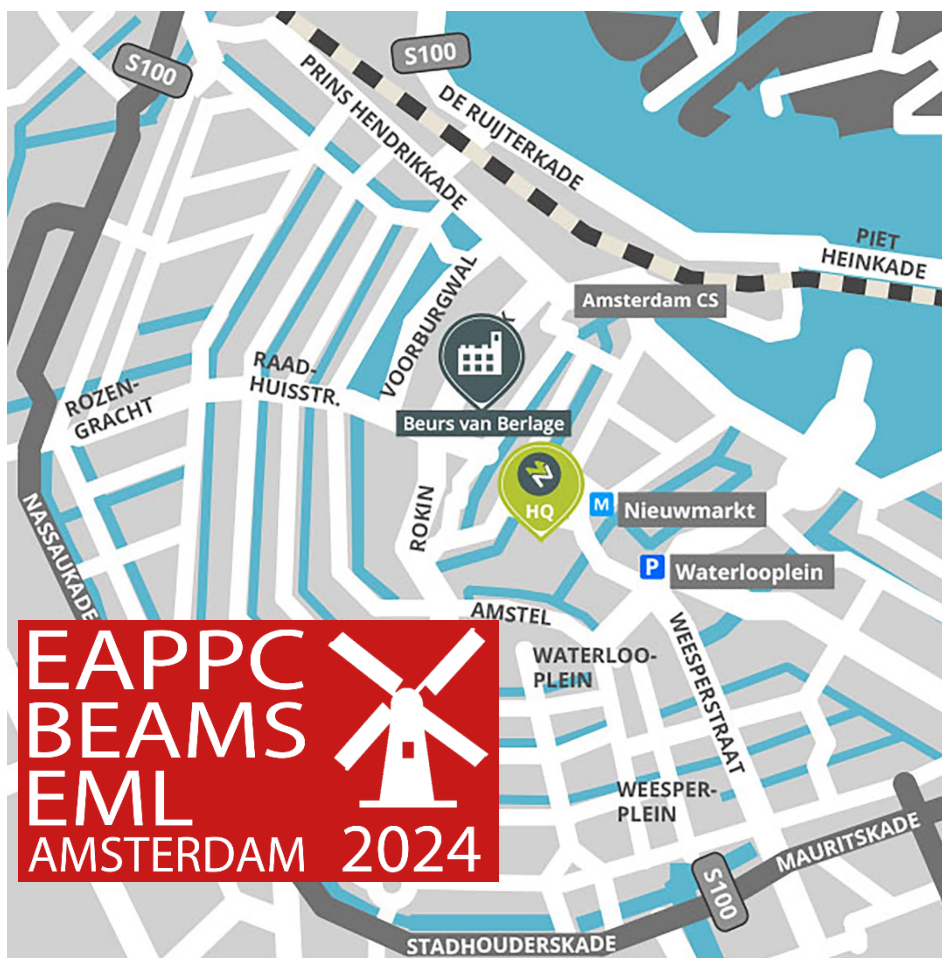
“The Beurs van Berlage venue – located in the heart of Amsterdam”

EAPPC-BEAMS-EML 2024 will be held at the ‘ de Beurs van Berlage Conference Centre ’, located in the heart of Amsterdam . Amsterdam is the Netherlands' capital, known for its artistic heritage, elaborate canal system and narrow houses with gabled facades, legacies of the city's 17 th -century Golden Age. Amsterdam has everything international conferences are looking for: great infrastructure, history, culture and multilingual population. It combines the friendliness and accessibility of a historic village with the world-class facilities and cultural attractions of a modern metropolis.