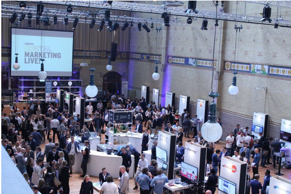
The Graanbeurszaal – location of the exhibition